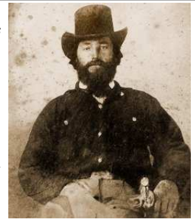
Br. Gen. John T Hughes

Outlaw Days Richmond Missouri September 6 2014 The Camp will set up our booth, spread the word and hawk our wares. We picked up several new members at the Richmond Mushroom Festival this last Spring.